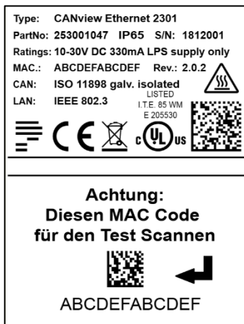
Before 20. December 2020

Reason for the expiration of the UL certification is the standard UL 60950 which is no longer applicable after the 20. December 2020.