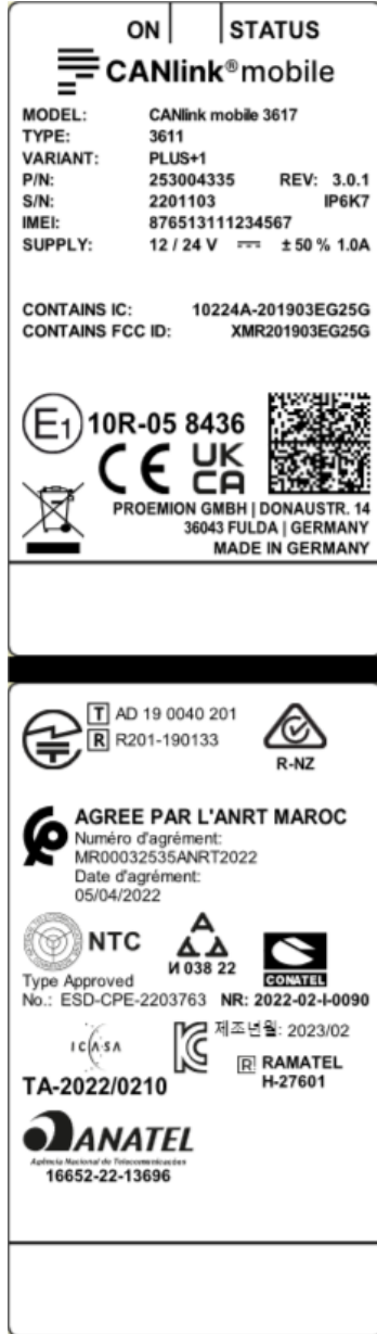
Unchanged Type Label: CANlink mobile 3611 Var. PLUS+1